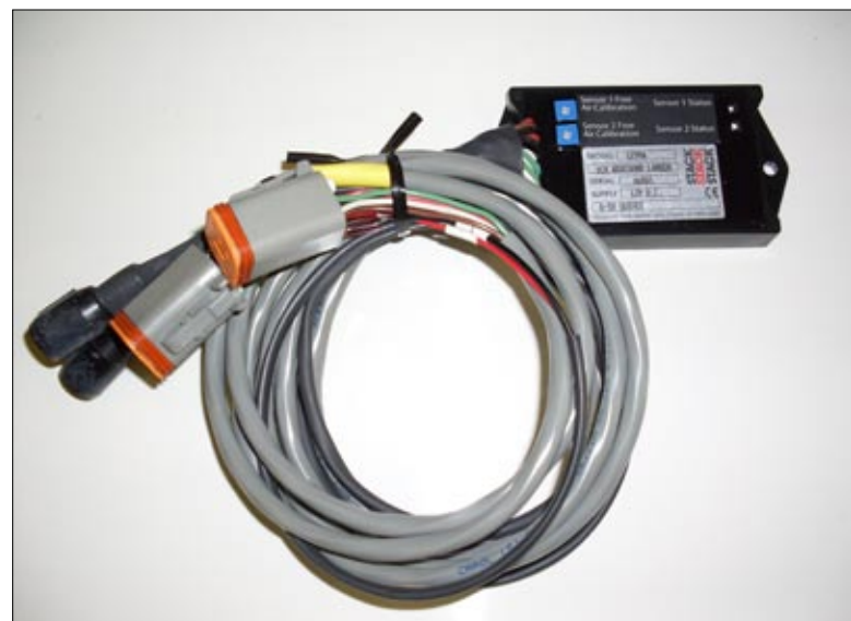
Figure 1 – Control Unit