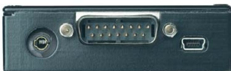
3.5mm AV Jack, 15 W "D", Micro-USB