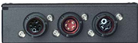
2 x 9W DDAS plus 1 x 5W AS