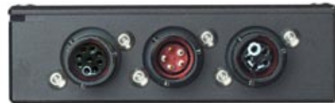
1 x 9W DDAS plus 2 x 5W AS